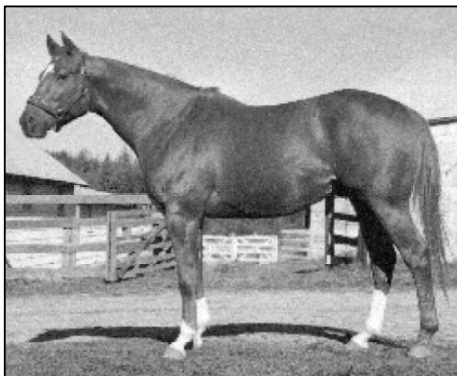
Well-bred Native-Born, sire of Chinook Pass, was brought to Washington in 1966. Native-Born was by one of the finest racehorses of the 20th Century, Native Dancer (lower left), out of "one of the best race mares ever to perform in America," Next Move (lower right).

Native Dancer would never lose again. He went on to win the Preakness, Belmont and many other top stakes races before foot